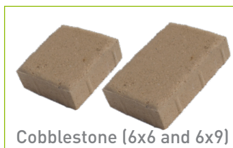
Cobblestone (6x6 and 6x9)