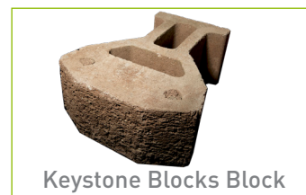
Keystone Blocks Block