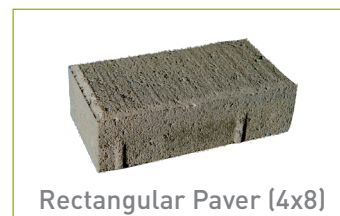
Rectangular Paver (4x8)