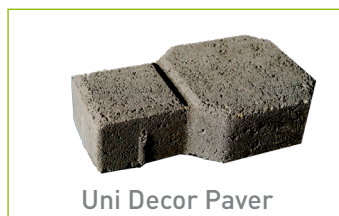
Uni Decor Paver